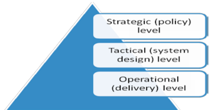
Figure 2.2: A Framework for Land Use/Transport Integration